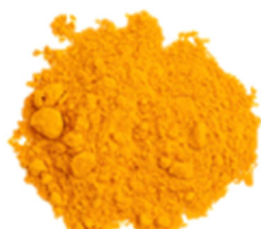
COENZYME Q10 UBIQUINONE